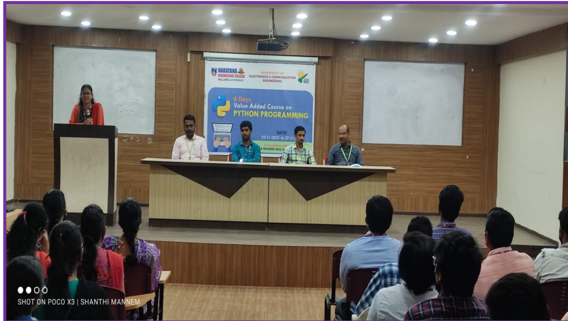
Inauguration of the Event

The Department of Electronics and Communication Engineering conducted a Value Added Course on Python Programming from 22/11/2021 To 27/11/2021 . The resource Organization was APSSDC, Andhra Pradesh. The IV B.Tech students from the ECE department have attended this Value Added Course.