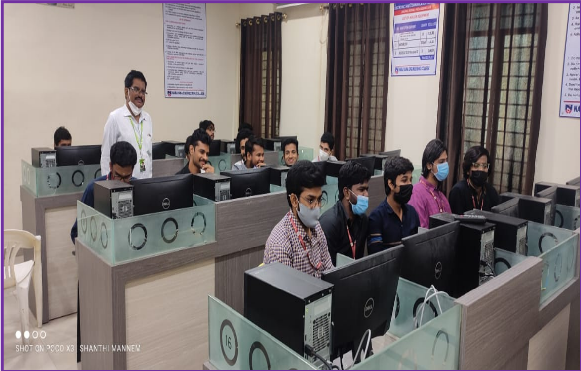
Students Practicing programs on Python

The Resource Person has covered the following topics: