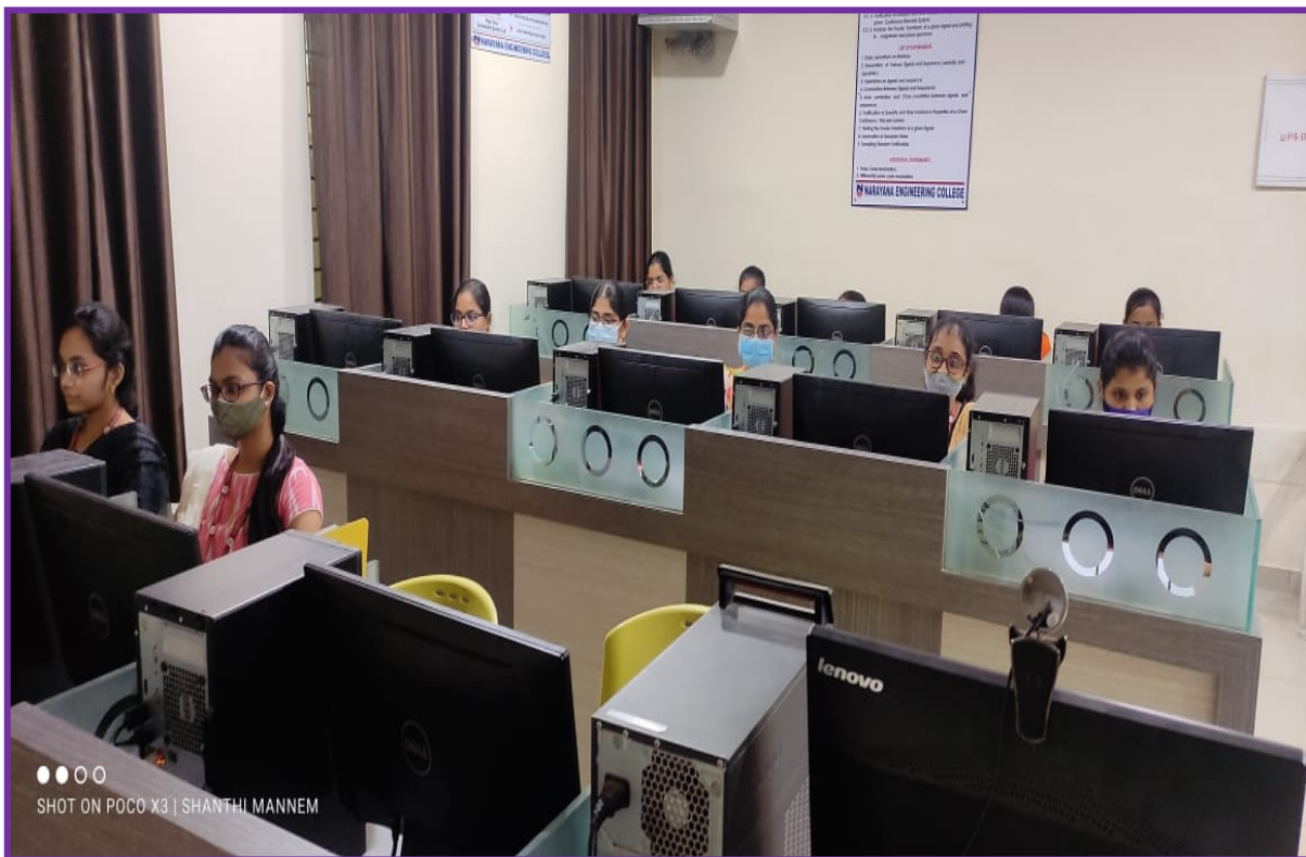
Students Practicing programs on Python

The course instructor introduced the Python programming to the students by stating that “Python Program is a scripting language that can be used for development, coding websites, and applications, processing images, scientific data and more. It was built for ease of use and speed is less complicated than Ruby and other similar object-oriented programming languages. Python also enables programs to script professional-grade web-based products.